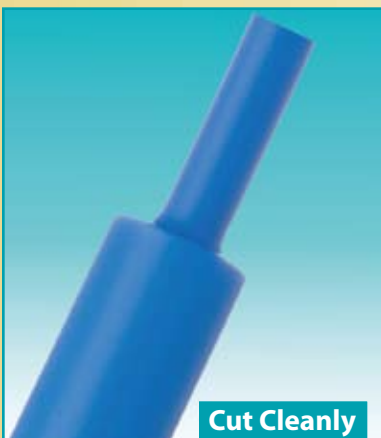
Cut Cleanly Scissor

■ Colors Available: 11= call for availability of colors.