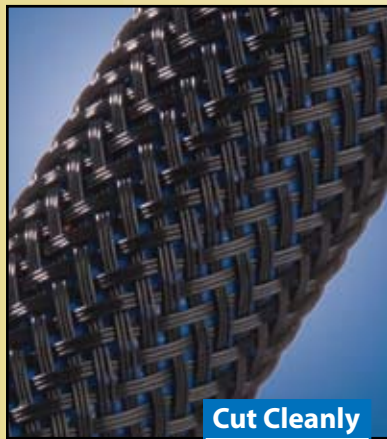
Cut Cleanly Hot Knife